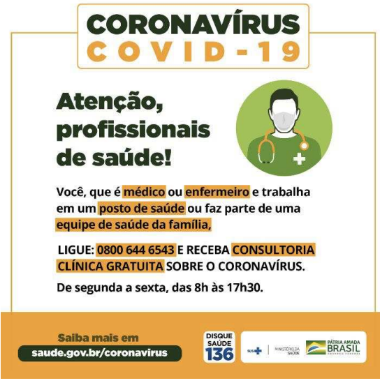
Figure 3B - Prevention