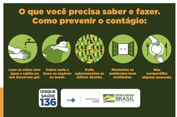
Figure 3C - Informal